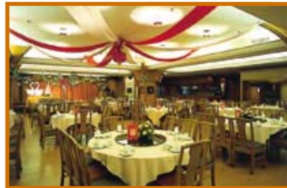
SUMMER PLACE RESTAURANT AT WISMA DIJAYA, DAMANSARA UTAMA, PETALING JAYA.

As mentioned in the last annual report, the Group has ventured into lifestyle restaurants during this financial year. The Group opened 3 lifestyle restaurants in Klang Valley, Malaysia namely Shrooms Fusion Restaurant located at Suria KLCC, Santini Ristorante Italiano located at Plaza Mont Kiara and Pickled Ginger Fusion Restaurant located at Kuala Lumpur Plaza ("KLP"). These 3 restaurants contributed RM3.2 million or 3.1% to the Group turnover.