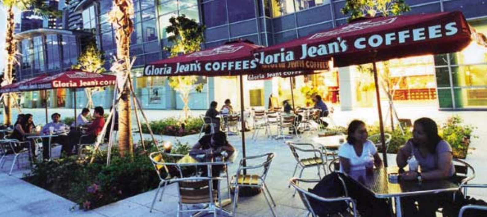
GLORIA JEAN'S OUTLET AT ONE FULLERTON, SINGAPORE.

In September 2000, the Company has via its wholly owned subsidiary, Specialty Beans Holding Sdn Bhd ("SBHSB"), subscribed for 9,798 Class A ordinary shares of 100 Baht each in Specialty Beans (Thailand) Ltd ("SBTL"), a company incorporated in Thailand, representing 49% of the total issued and paid-up share capital of SBTL which entitled to 79.35% of the total voting rights in SBTL at par for a total consideration of 979,800 Baht only, thus making SBTL a subsidiary of SBHSB. In that same month, SBHSB has entered into a second Area Development Agreement with Gloria Jean's Gourmet Coffee Franchising Corp. for the exclusive right to develop, own and operate a minimum of 40 Gloria Jean's gourmet coffees stores or kiosks within Thailand in the next five years.