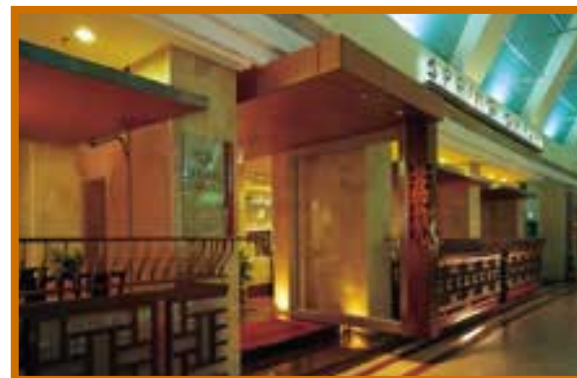
SPRING GARDEN AT SURIA SHOPPING COMPLEX, KLCC.