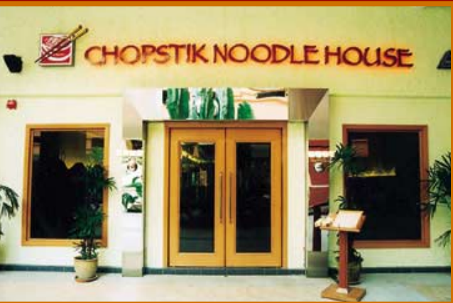
CHOPSTIK NOODLE HOUSE AT PLAZA MONT KIARA.